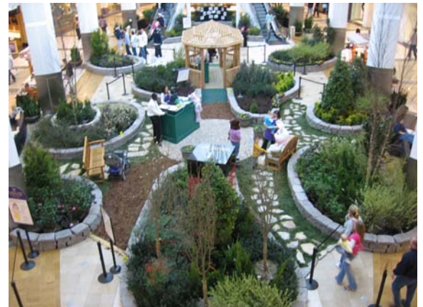
View of the Easter Bunny at the Leisure Landscapes Exhibit at Triangle Town center.