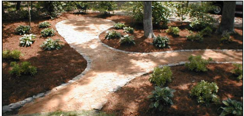
A walkway by Leisure Landscapes at the beautiful Foland residence.

The walkway itself can widen the range of the sensory enjoyment of your landscape. Walking on varied textures and having a choice of following the path or not will make strolling to the mailbox a pastime instead of necessity.